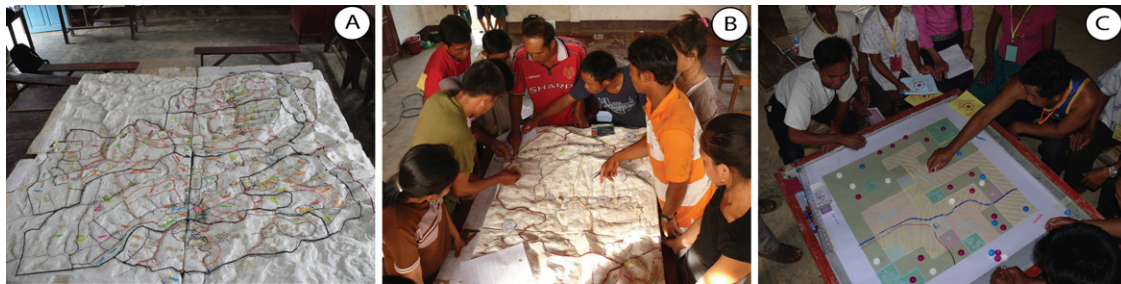
Fig. 2. Boundary objects support interactions between people and landscapes. (A) Land use zoning in Muongmuay village cluster on a participatory 3D model (see also Fig. 1C). (B) 3D modeling facilitates villagers' comprehension and participation. (C) A virtual landscape is used to simulate land use planning.